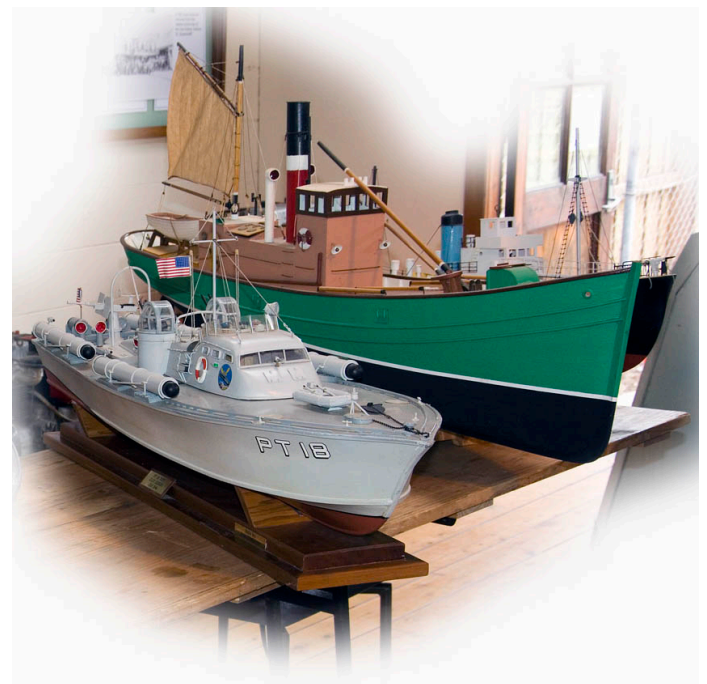
Below: MTB and fishing vessel of the Geelong MBC