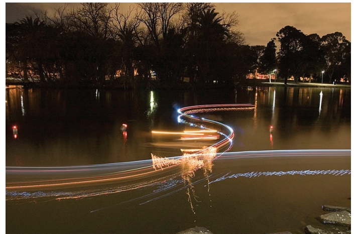
Ribbons of light paint the courses of our model boats at Queens Park Lake

Sailing day 12th; Cairnlea 26th; Illawong 19th; Surrey Park MBC various events, check with them for dates; Como Gardens Open Day 79 Basin-Olinda Rd The Basin 25th-26th.