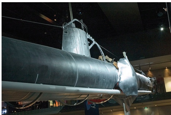
The composite Ko-Hyoteki at the Australian War Memorial

The potentially devastating attack by the Imperial Japanese Navy on Sydney Harbour, at the time full of allied warships moored in a state of low readiness, was rendered ineffective largely due to luck being heavily on the side of the allies.